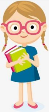
OLD Report Card